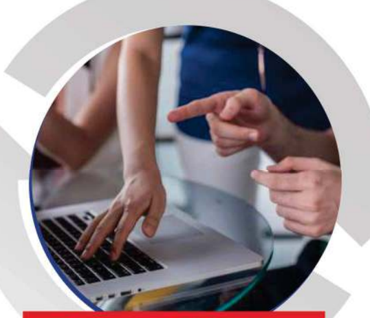
Support & Service